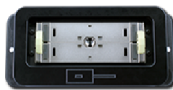
ULT-PA-30 GE Adapter