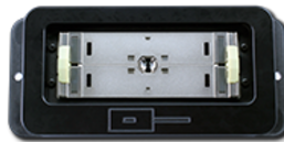
ULT-PA-30 GE Adapter